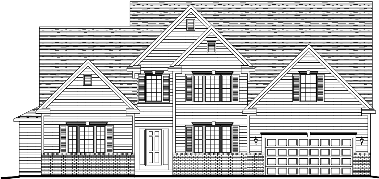
Elevation "B" • With Brick & Siding Front