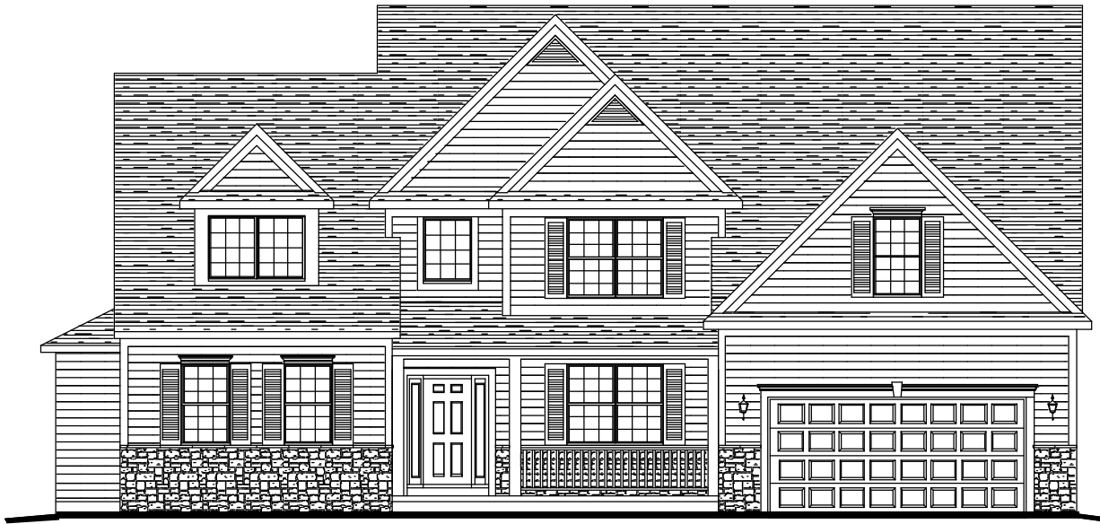
Elevation "A" • With Stone & Siding Front