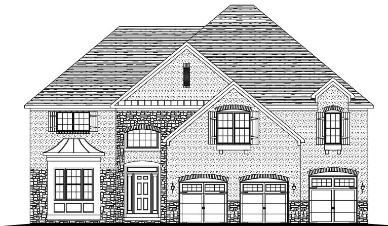
◀ Elevation "B" Parade • Available With Stone & Stucco Front Only