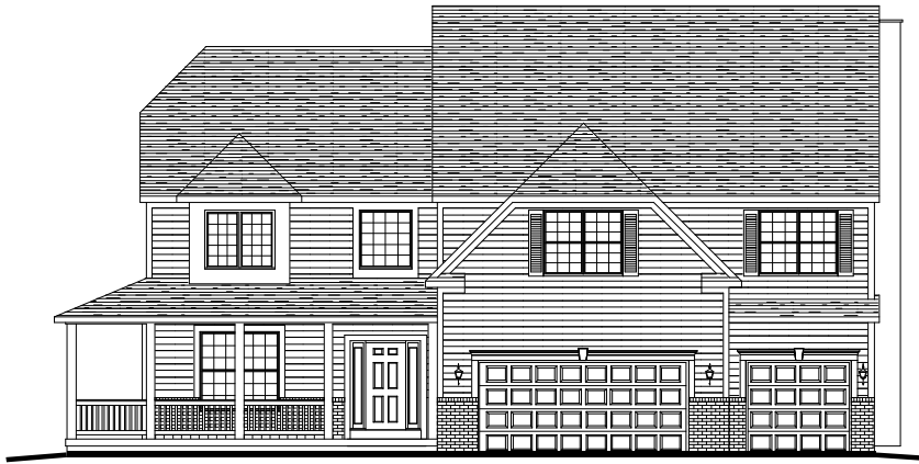
◀ Elevation "A" • With Brick & Siding Front