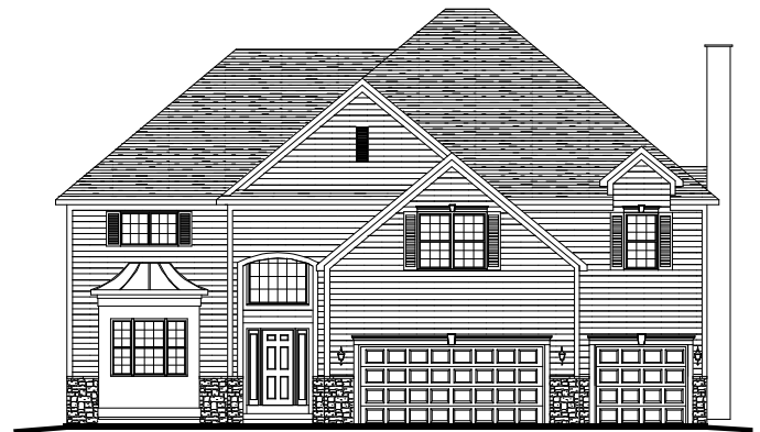
Elevation "B" ▶ • With Stone & Siding Front