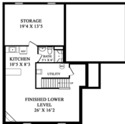
FINISHED LOWER LEVEL