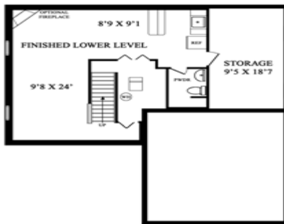
FINISHED LOWER LEVEL